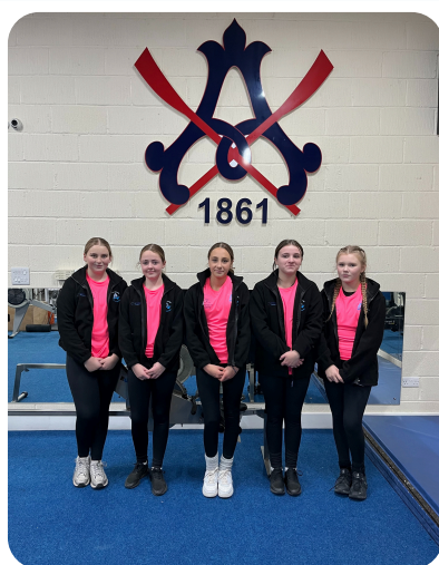
Year 8 Rowing Team

The Year 8 rowing team received their new uniform and got back into training ahead of the indoor rowing championships on 22 nd January. We wish them the best of luck!